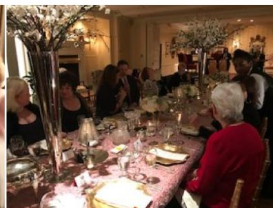
The beautifully designed seating for a the Gala dinner