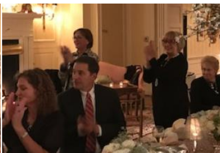
Applause for the organizers, the dinner, the music – a Celebration of IFDA's 70th Anniversary