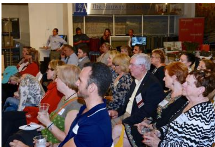
Audience for the panel discussion in the Landry and Arcari showroom.