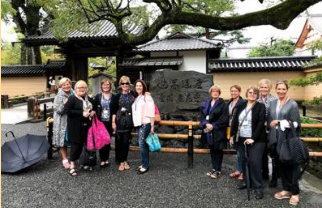
Japan Trip, Page 2