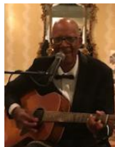
Delicious dinner, good times, and music made the Saturday night Gala at The Country Club of Virginia truly spectacular.