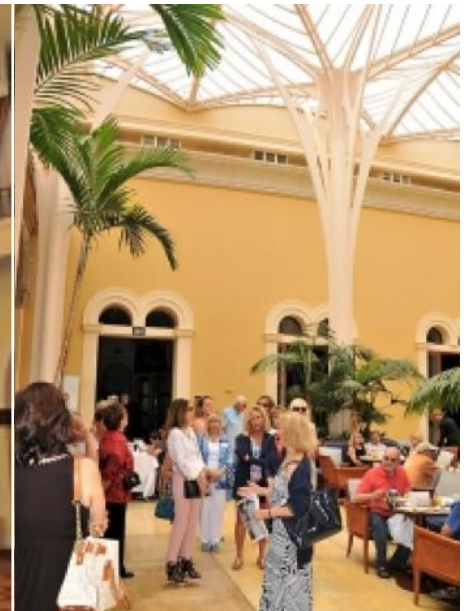
Ballroom with retractable ceiling

Can you guess what was once housed in this room? An indoor swimming pool, which was seldom used, is now below the floor of this gathering space.