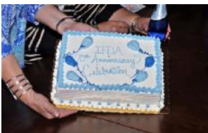
Happy 70th Anniversary IFDA!