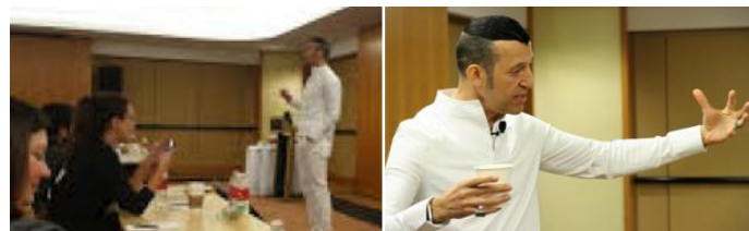
Keynoter Karim Rashid speaks to attendees at EF's DesignEDGE summit in New York, May 20.

The 2017 event ended with an after-party hosted by Revis Studio at UrbanOfficeNY and with the news that DesignEDGE 2018 is being planned as a collaboration with the Las Vegas Market.