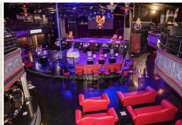
The Royale Nightclub - Boston - Ready for the event to start!