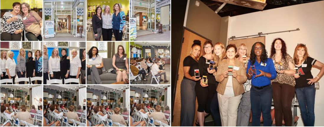
Arizona Membership Drive at The Shade Store - Arizona event at The Shade Store