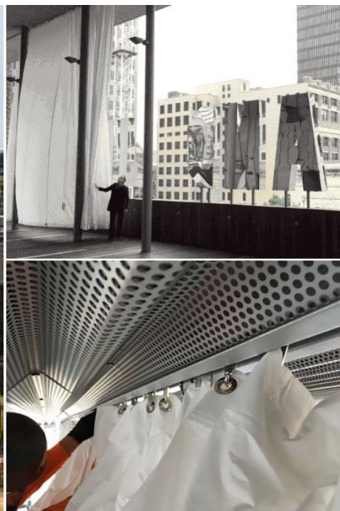
The Project was a tall order: 250 linear feet of 22 feet high curtains, fully operable.