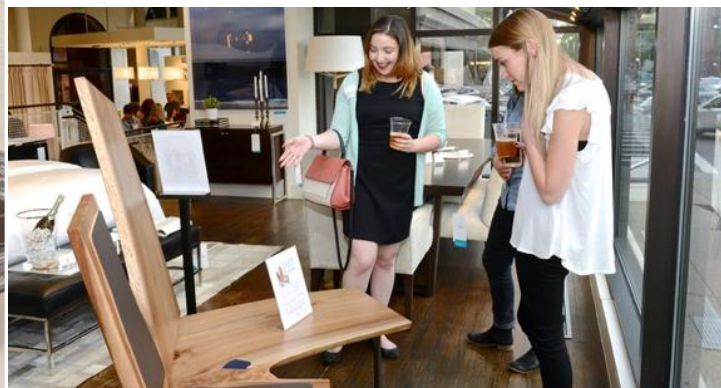
Member JD Communications' Staff admiring Diamond Sponsor Hutker Architect's Chair