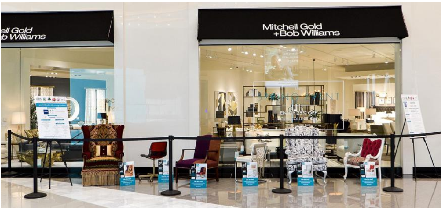
Chairs on Display outside Mitchell Gold+ Bob Williams

Thank you to our many designers, volunteers, committee, sponsors, and especially BIDDERS for making the event a huge success.