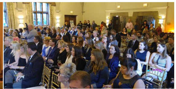
Crowd of happy bidders at Merion Tribute House