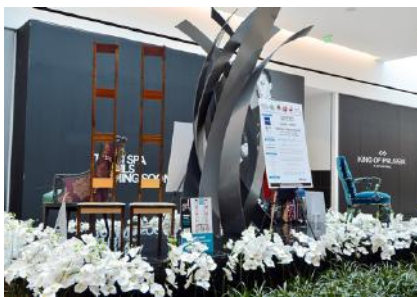
Chairs on Display at King of Prussia Mall