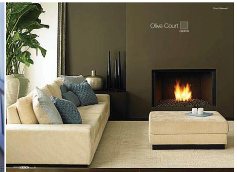
Dunn Edward Paints