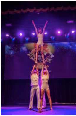
Acrobats on stage!