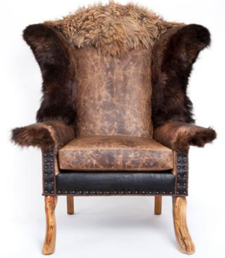
White Buffalo Fundraiser at Buffalo Collection - Buffalo chair