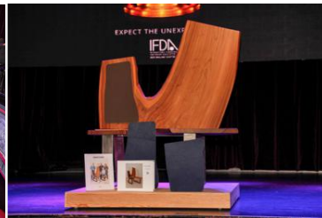
Diamond Sponsor Hutker Architect's Chair Entry on stage, ready for the auction!