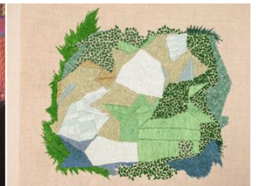
Embroidery on Linen Fragmented Flowers IV