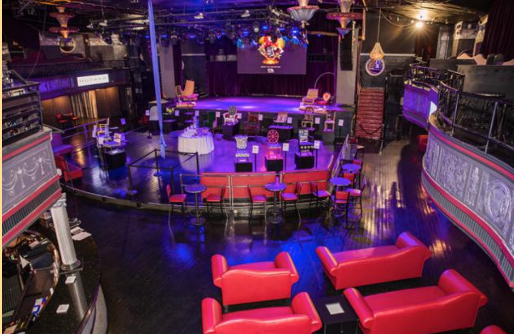
The Royale Nightclub in Boston, New England Chapter, Page 6